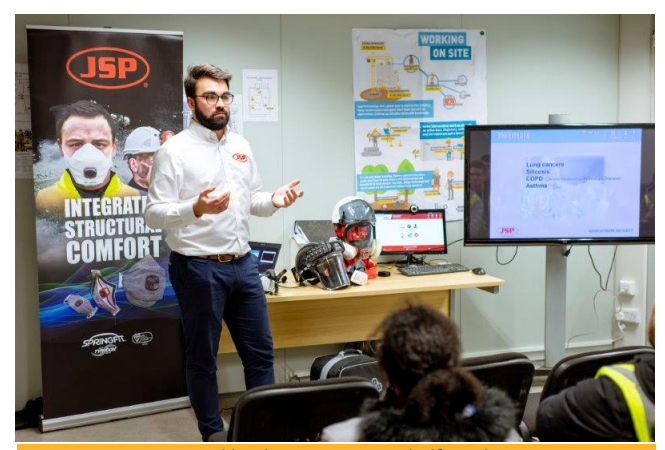
Figure 2: Bowmer + Kirkland team receiving half mask training

Disposable FFP respirators were the default choice among subcontractors on site. A wide range of makes, models and sizes were in use and it was impossible to ensure all workers had the correct RPE that they had been face-fitted for.