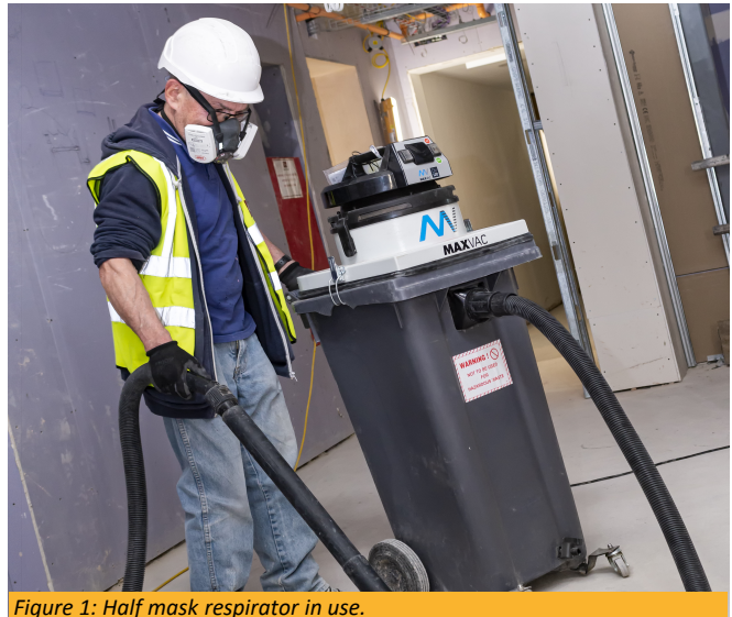
Figure 1: Half mask respirator in use.

We identified a solution that included press to check filter technology for reassurance that there was proper face-fit to ensure a consistent, higher level of respiratory protection over a longer period of time.